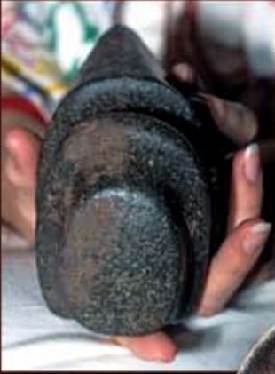
Possibly my favorite piece (also shown on page 136)